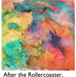
After the Rollercoaster, Todd Ohler