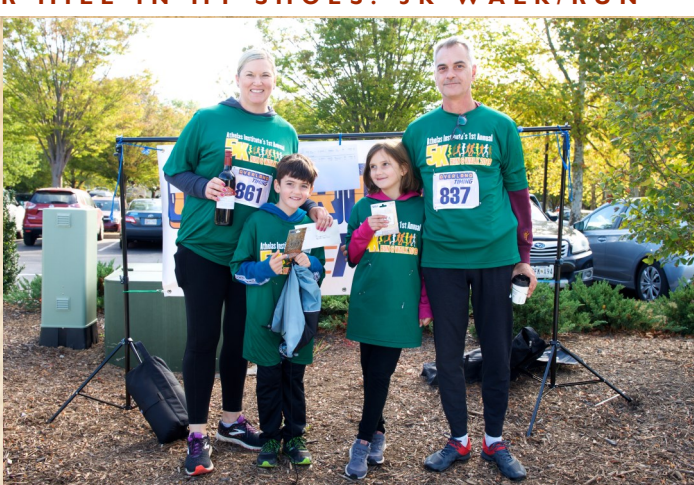
Papailiou Family – Participants, supporters and very happy multiple winners!