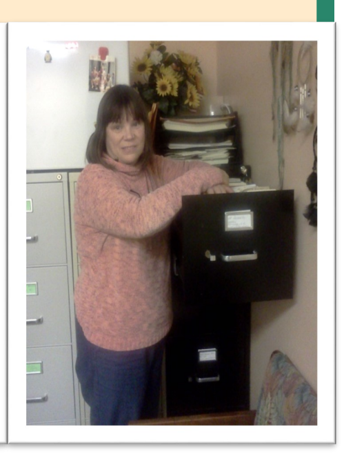
Athelas Institute 9104 Red Branch Road